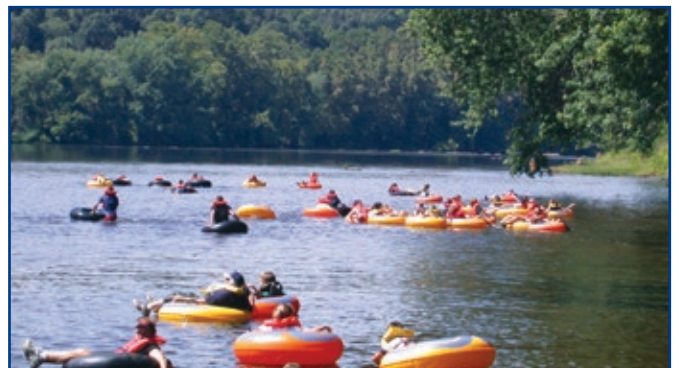
Tubing on the James River

The park is located 7 miles north of Route 60 on Route 605 in Buckingham County. The entrance to the park is located at the intersection of Route 605 and Route 606. For more information about this beautiful park, please call 434-933-4355.