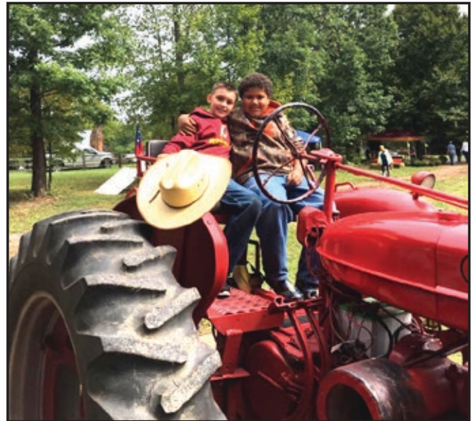
The Fall Farm Fest is Oct 5, 2024