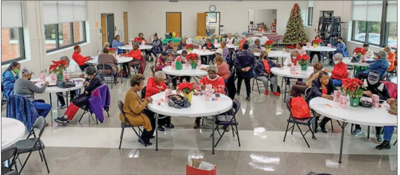
Bingo Christmas Fun

The Buckingham Active Seniors get together for fellowship and to possibly learn something