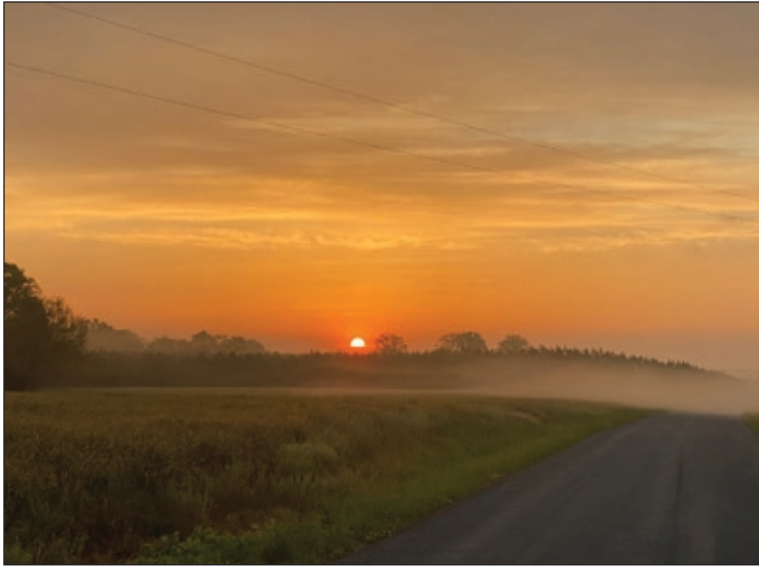
3rd Place Favorite View Betty Shapiro "Sunset"