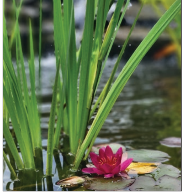
1st Place Youth Entries Kelsi Steinruck "Lily Pad"