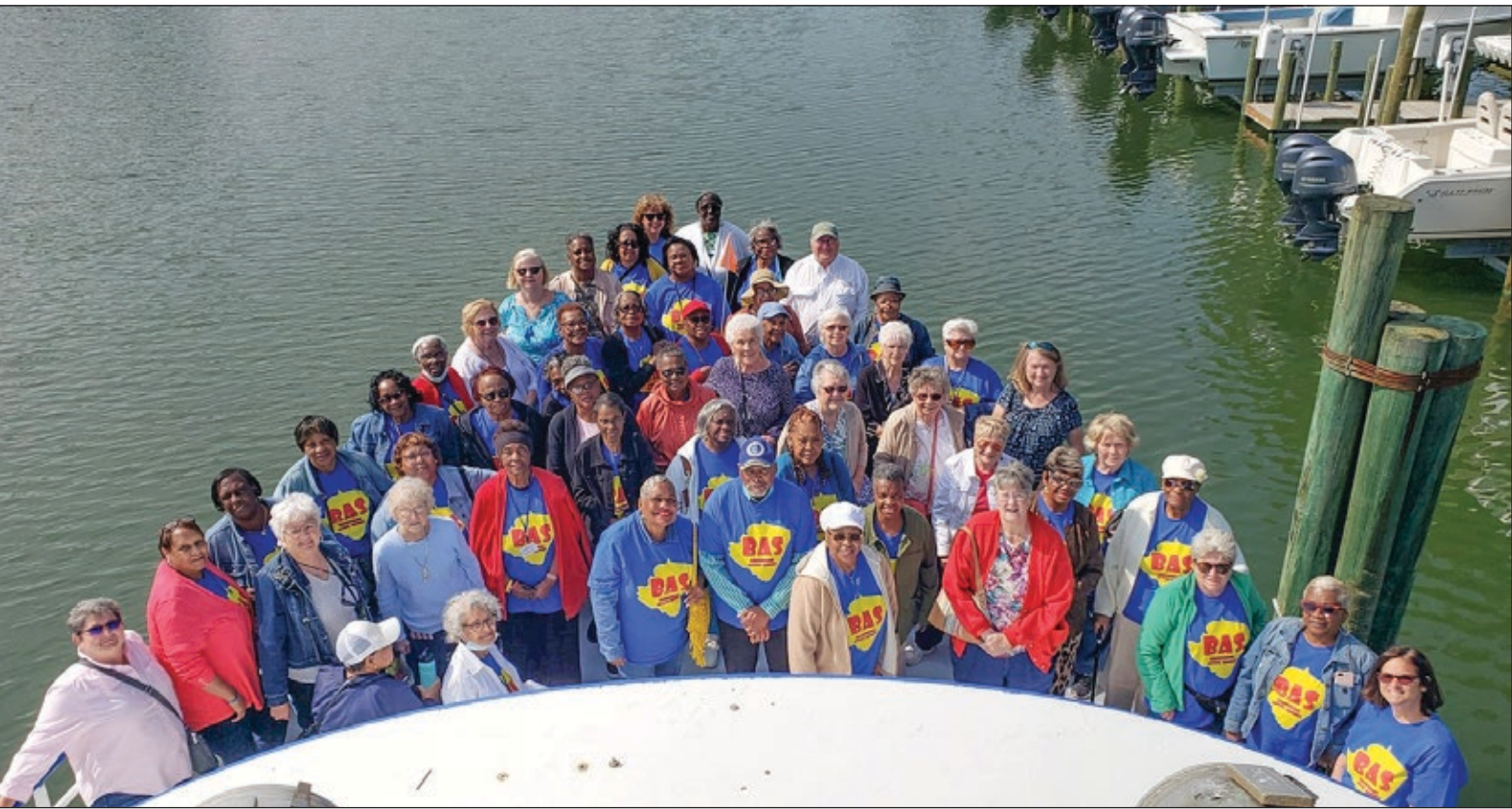
A Nice Visit to Tangiers Island

T he Buckingham Active Seniors a fun group of individuals, ages 50 and up, who come together to share common interests and explore new ones. Their goal is to provide fun and exciting activities for senior citizens in Buckingham County.