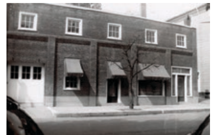
Thacker Brothers Main Street location 1931-1965