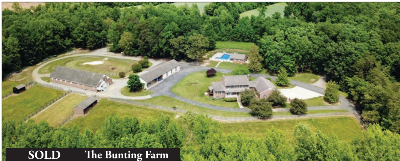
SOLD The Bunting Farm

Listing land and homes in your area, representing both sellers and buyers.