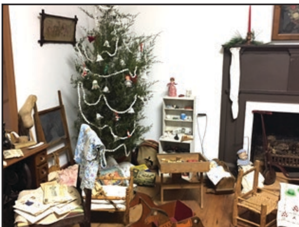
The Housewright Museum Christmas Open House is December 7 & 8, 2024