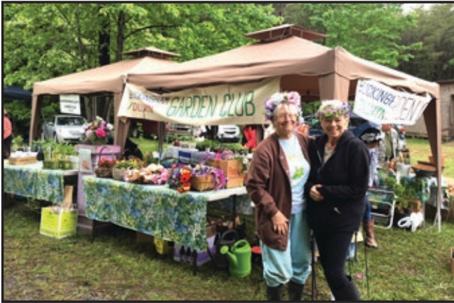
Mayfest (Buckingham County Day) May 18, 2024