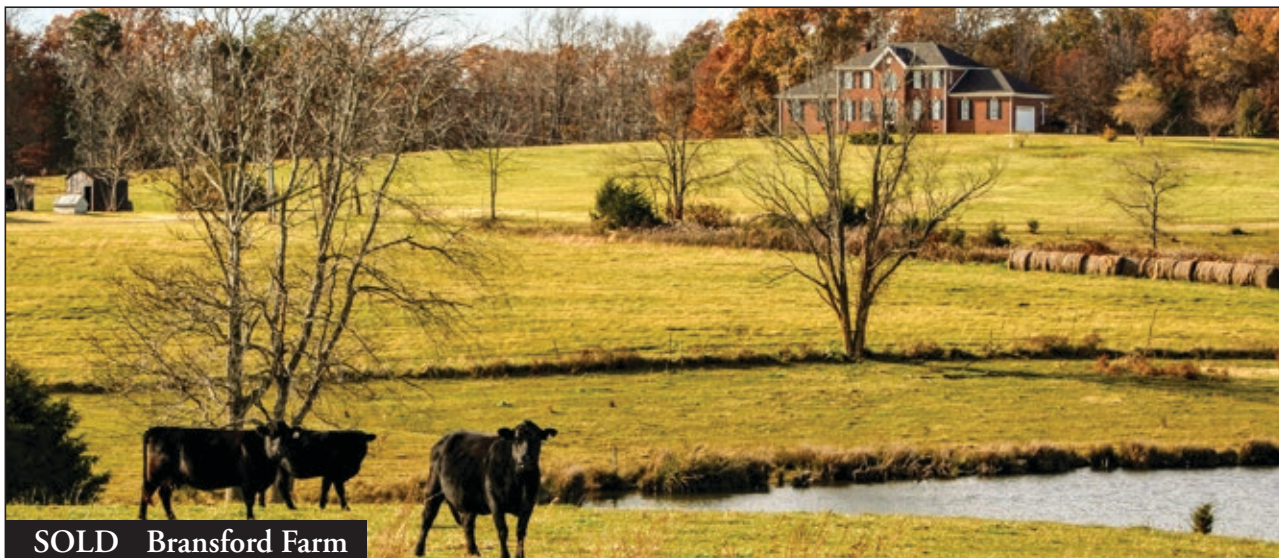
SOLD Bransford Farm