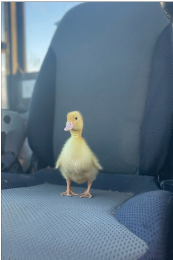
Honorable Mention Youth Entrees Tucker Steinruck “Duck In the Bucket”

Other Winning Photos Were Unavailable at Press Time, Including