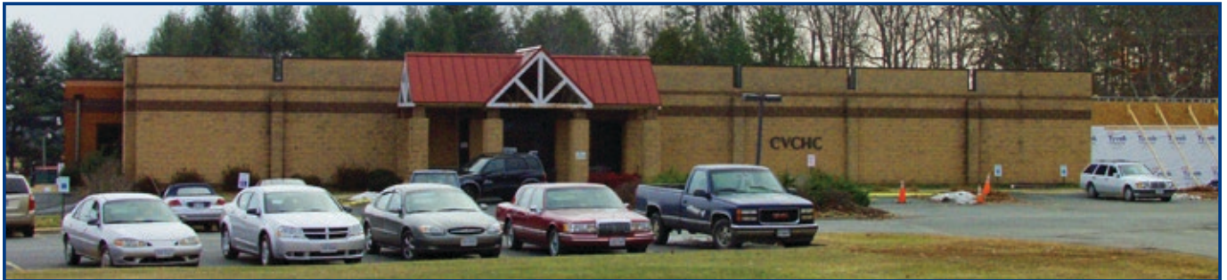
Central Virginia Health Services (CVHS)

Interpretive programs are offered Memorial Day through Labor Day and include guided canoe floats, wagon