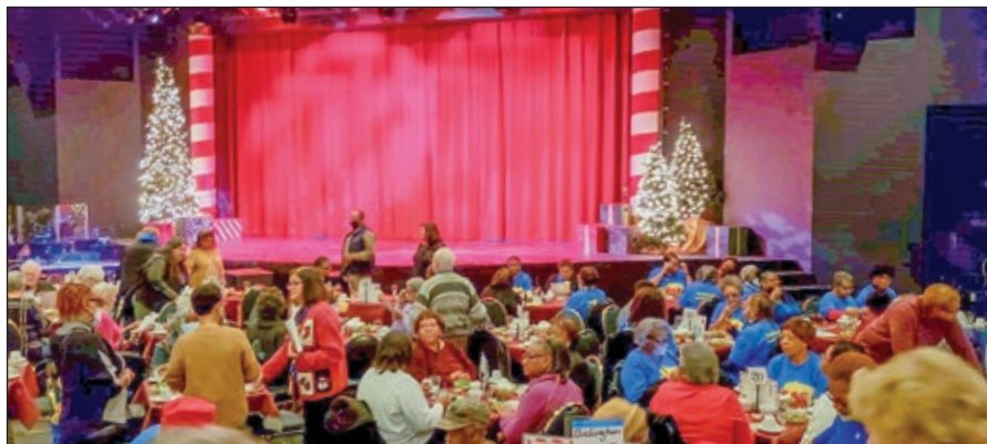
A Trip to Riverside Dinner Theater

In June of 2023, the group held a "Senior Prom," a wonderful evening of getting dressed up for dinner and dancing that