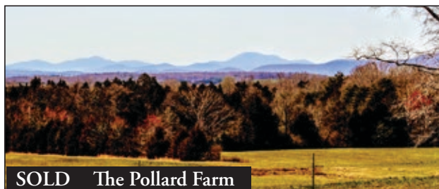
SOLD The Pollard Farm

As a central Virginia native, I have broad experience with local land and farms in addition to many years in residential construction.