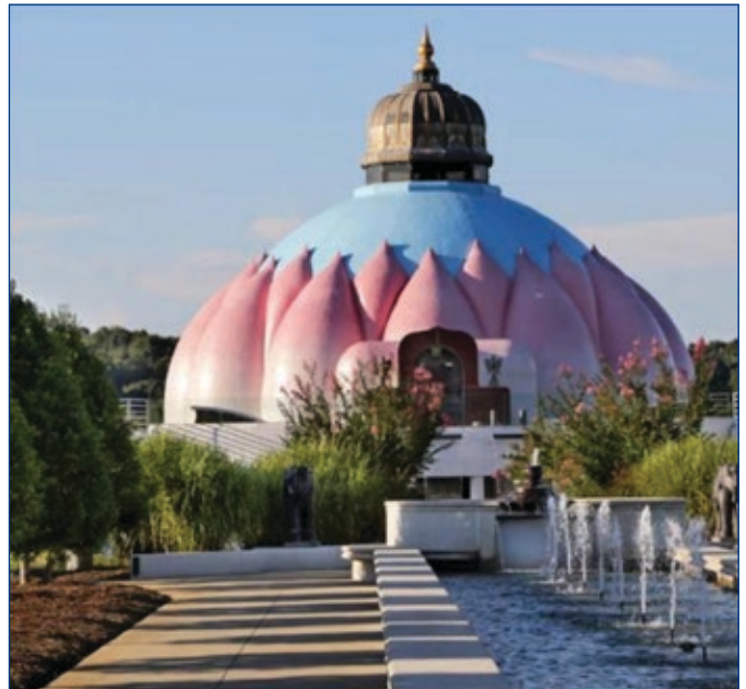
The LOTUS Temple in Yogaville. For more information, visit yogaville.org

The three largest employers in Buckingham County are the Buckingham Correctional Center, the Dillwyn Correctional Center and Kyanite Mining Corp. Other large employers include Boxley-Buckingham Slate, LeSueur-Richmond Slate, Buckingham County Government, Central Virginia Health Services, Food Lion, VDOT, Pierce Johnson Lumber, Seay Milling, First Bank, Hi-Test Labs, Heritage Hall Nursing Home, Discovery Schools,