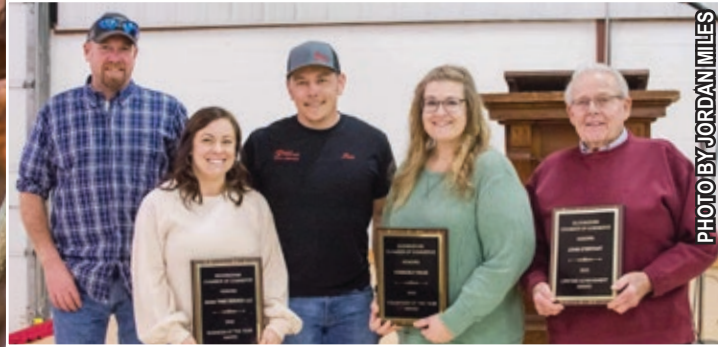
Local Residents Honored