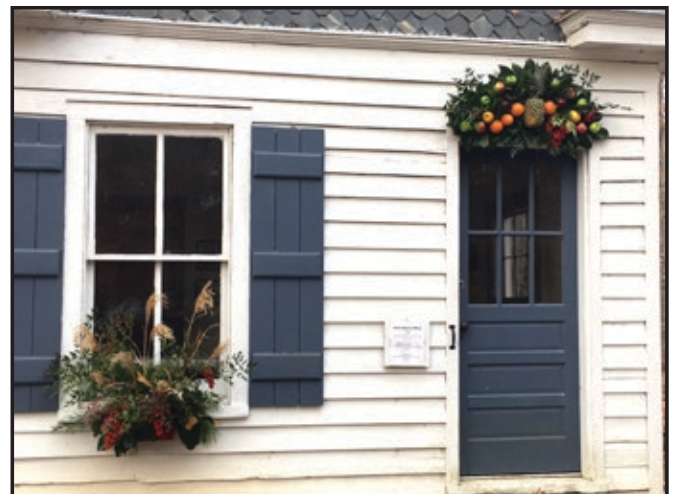
The Village Christmas Market is December 7th 11:00 am – 4:00 pm