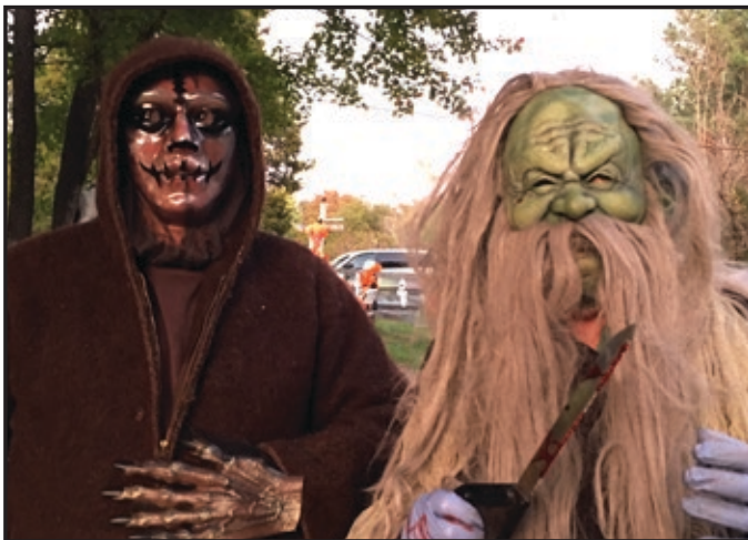
The Spooky Hollow Drive Thru, October 26, 2024