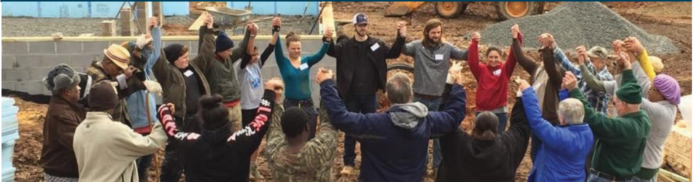
A Recent Habitat For Humanity Project Bringing People Together