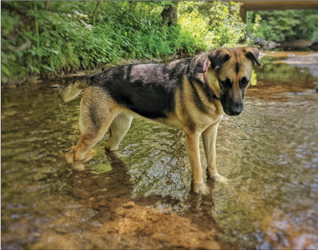
Honorable Mention Children, Wildlife, Domestic Animals Nicole Kirby "Dog In the Water"