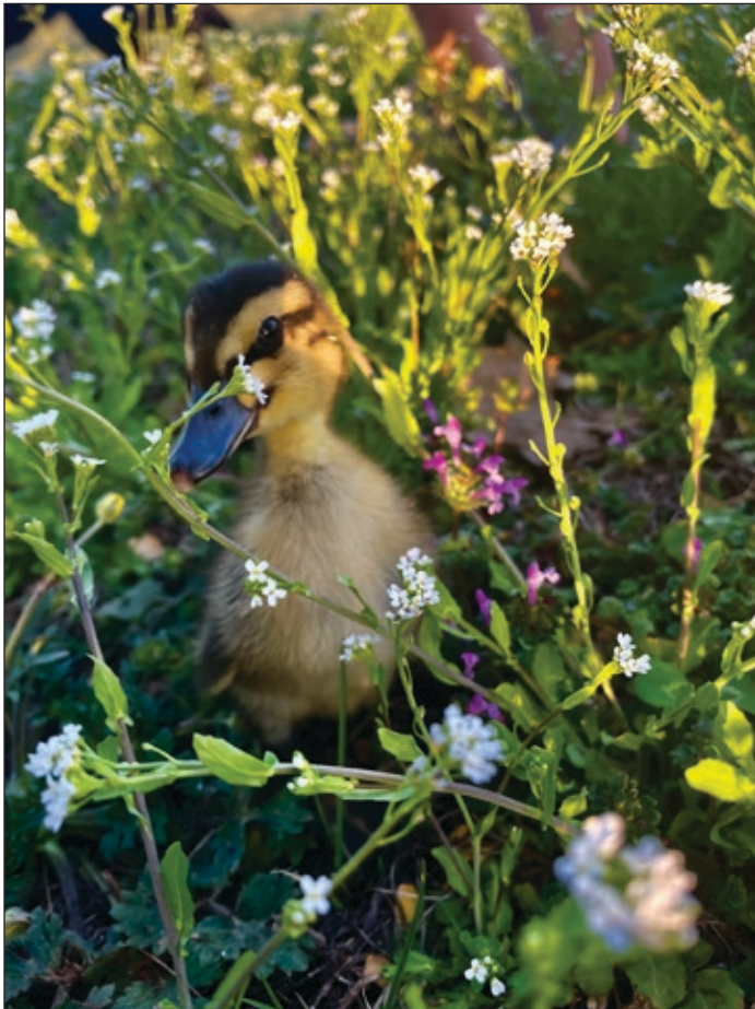
2nd Place Youth Entries Liam Steinruck "Ducks & Flowers"