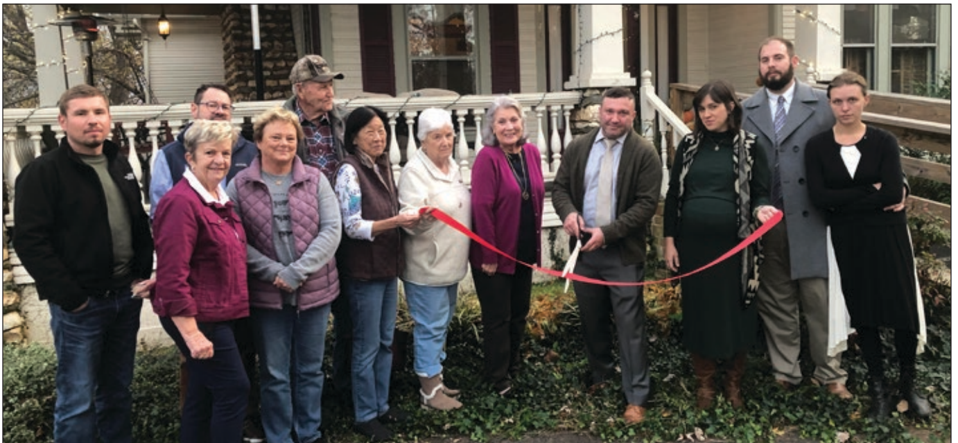
Grand Opening & Ribbon Cutting At Reinhardt & Vandenbrook Law Firm