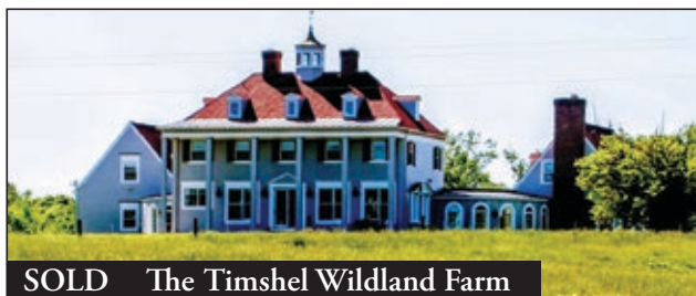
SOLD The Timshel Wildland Farm