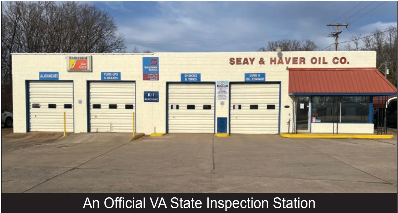
An Official VA State Inspection Station