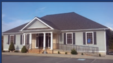
Lake Monticello - 434-589-0920