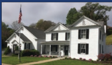
Scottsville - 434-286-2791